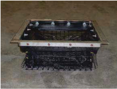
DROP INLET WITHOUT CENTER PORT

All filters are custom made to any shape or size!